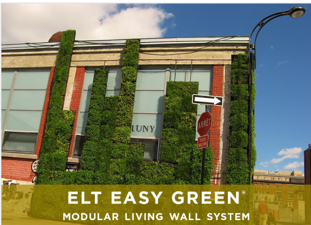
ELT EASY GREEN® MODULAR LIVING WALL SYSTEM