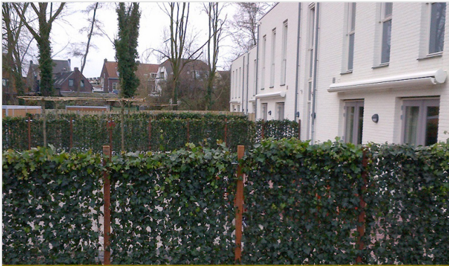
GREEN LIVING FENCE FILTREXX® LIVINGWALLS™ SYSTEM